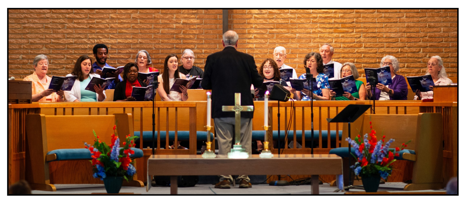
Beautiful Easter music from our choir! More to come in the next issue...